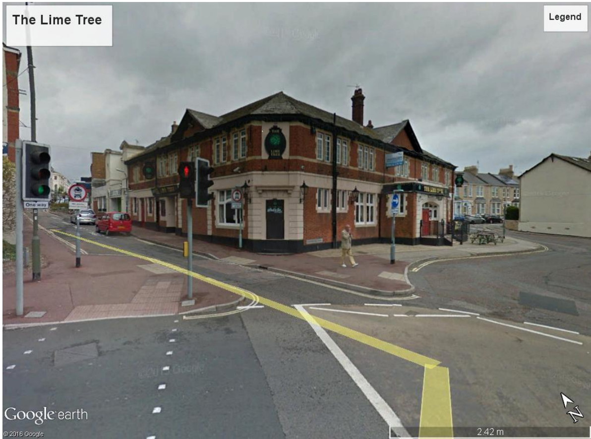
Fig 1 - Street view of the Lime Tree