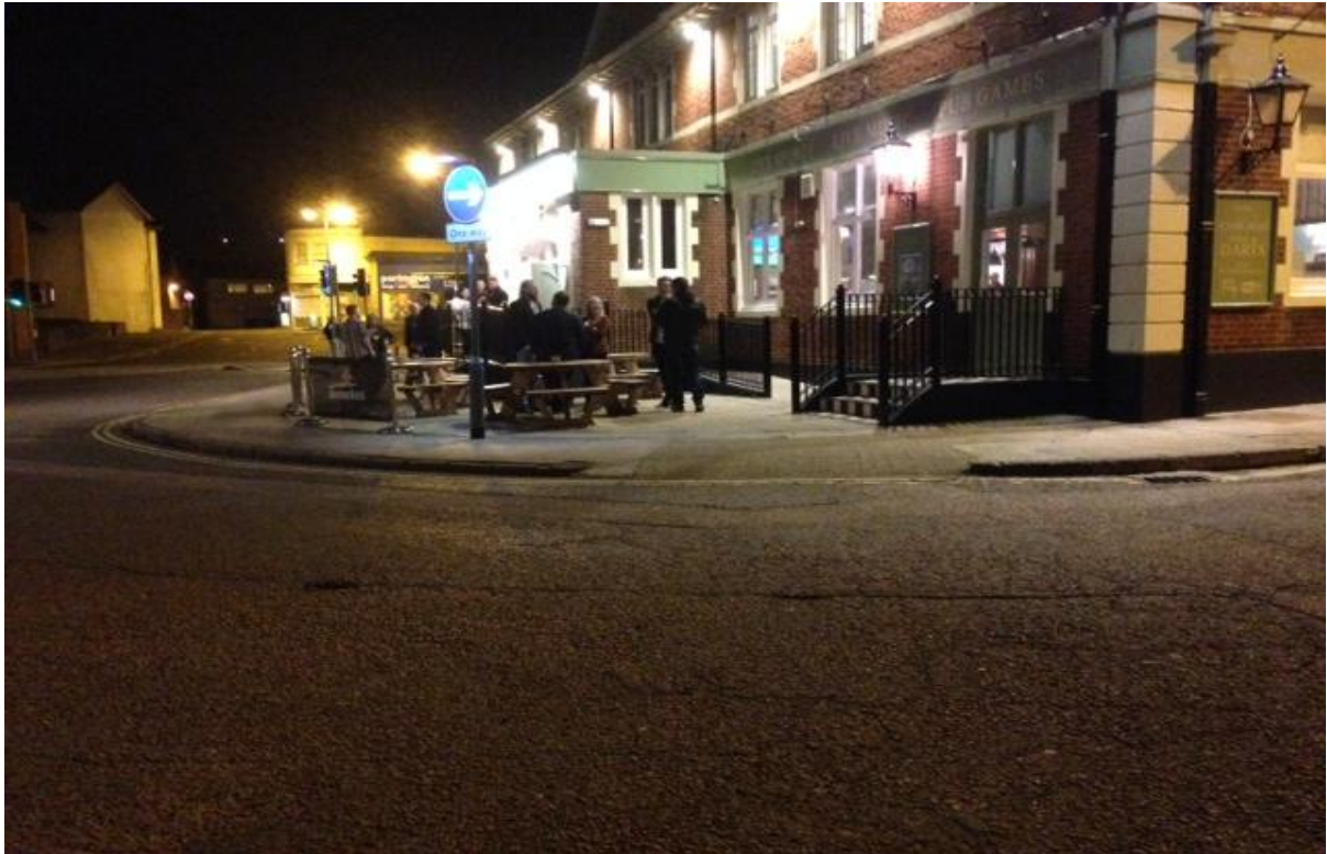
Fig 1 – Lime Tree, Paignton